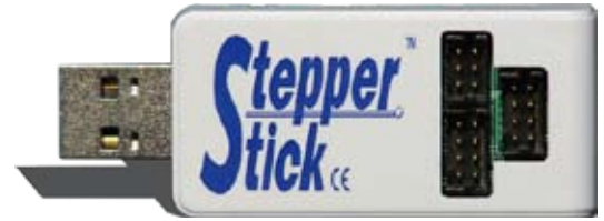
STEPPERSTICK™ actual size