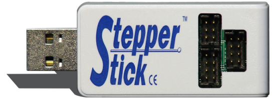
STEPPERSTICK™ actual size